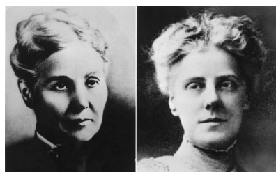
Anna Jarvis founded Mother's Day in honor of her mother, Ann Marie Reeves Jarvis.

In 1907, Anna Jarvis held a private Mother's Day celebration in memory of her mother, Ann Jarvis, in Grafton, West Virginia. Ann